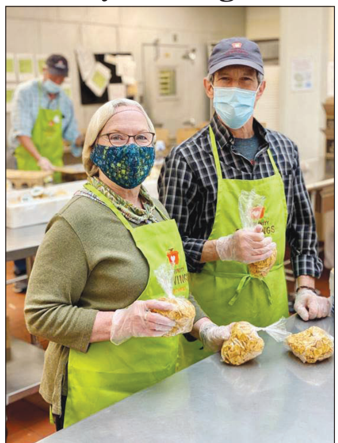
Volunteers with Community Servings work on packaging some foods for in accordance with medically tailored meals.

For health and safety reasons, all volunteers are required to be fully vaccinated, have their temperature taken, and wear a sur-