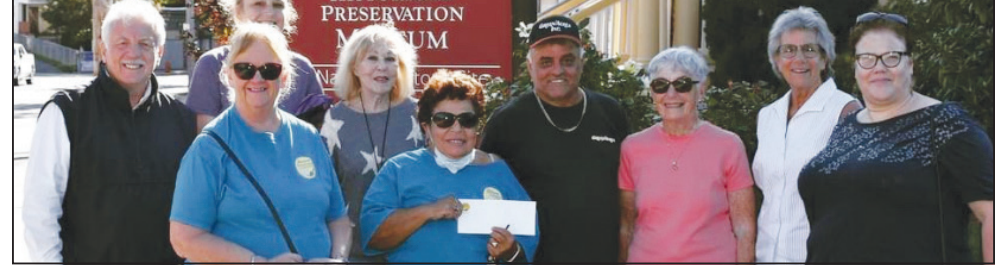
The Revere Society for Cultural and Historical Preservation.